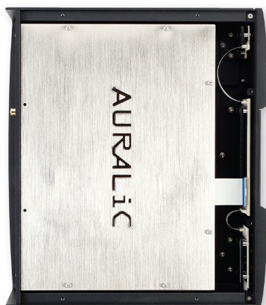
ABOVE: Hidden under the top-plate and screening the digital electronics within is a separate nickel-plated copper enclosure

The Aries G2.2 brought out the two DACs' respective characters: detailed and crisp for Musical Fidelity's model, transparent and exact for T+A's. The percussion in the lively background on 'Little Margaret', for example, was a shade more expansive and natural via the DAC200. Determining differences between D/A converters is always challenging, but I felt the Aries G2.2 was aiding the investigative process, not muddying the waters.