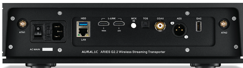
ABOVE: Digital only – the Aries G2.2 offers wired/wireless network control/streaming inputs plus access to more music via internal and external (USB) drives. DSD512 and 384kHz outs are on USB-A, 'L-Link' on HDMI, DSD64/192kHz on Toslink, coax and AES

server and a large stream must be transported over the local network).