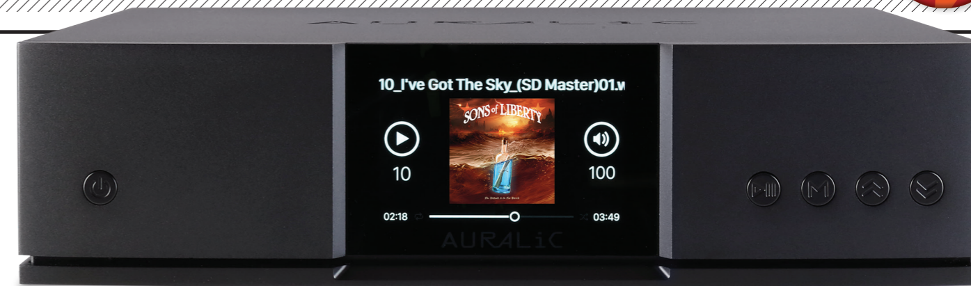
ABOVE: The 4in TFT display reveals the library of albums/songs available or in play (inc. cover art) in addition to allowing the user to navigate the comprehensive system/set-up menu

Plenty of changes here, then, but Auralic is nothing if not consistent when it comes to features and app control. From its entry-level models to the elite G3 units (which, for the first time, will be built in the US), you use the same Lightning DS app and broadly speaking enjoy the same user experience. I have no complaints about that, as Lightning DS is a good reason to pick an Auralic device over other streamers. The interface is responsive and fun to use, both when playing music